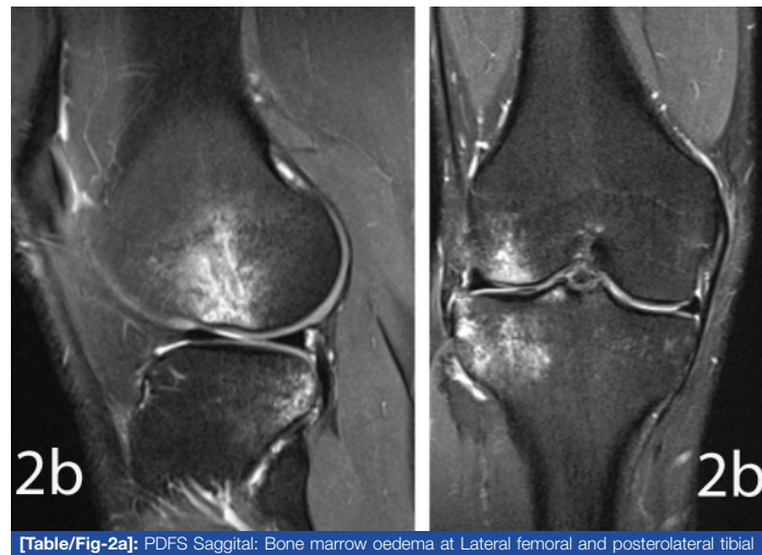
plateau in Pivot shift injury. [Table/Fig-2b]: PDFS Coronal: Bone marrow contusion at lateral femoral condyle and lateral tibia plateau in Pivot shift injury pattern.

pattern. [Table/Fig-1b]: T1W Saggital: Bone marrow oedema at Lateral femoral condyle in Clip injury