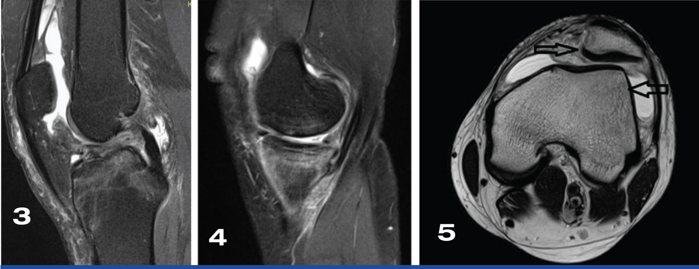
[Table/Fig-3]: PDFS Saggital: Bone marrow oedema at proximal tibia in Dashboard injury. [Table/Fig-4]: PDFS Saggital: Bone marrow oedema at Medial femoral and Medial tibial condyle in Hyperextension injury. [Table/Fig-5]: T2 Axial: Bone marrow oedema in Inferiomedial aspect of patella and lateral femoral condyle in lateral patellar dislocation.